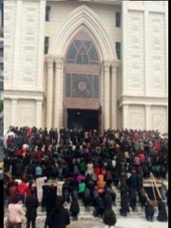
The Sanjian Church